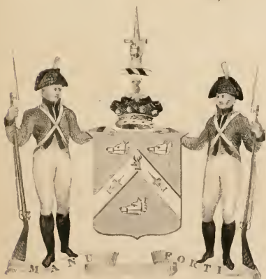
Murray, Lord Rieu.