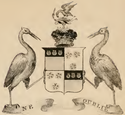
Strathmore, Duke of Montrose.