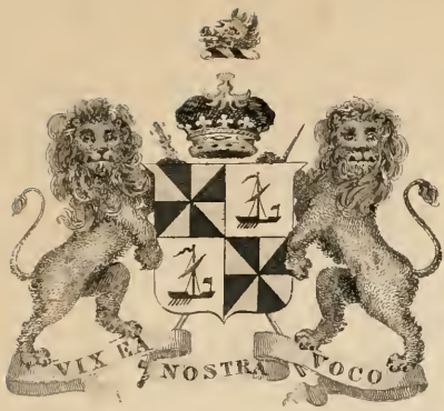
Campbell, Duke of Argyll.