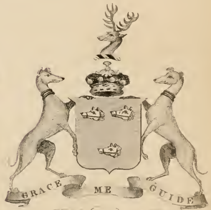
Forbes, Lord Forbes.